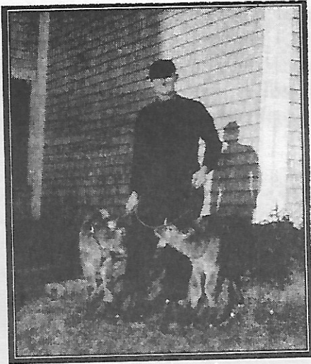
Dad with twin calves