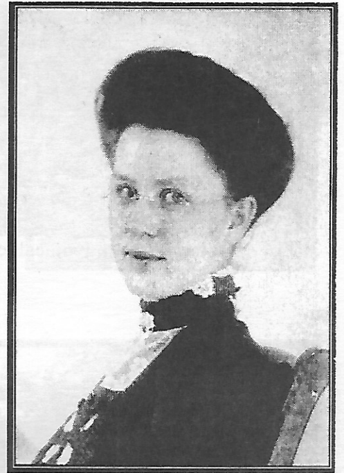
Marm at age 19 Roslindale, Massachusetts - 1909