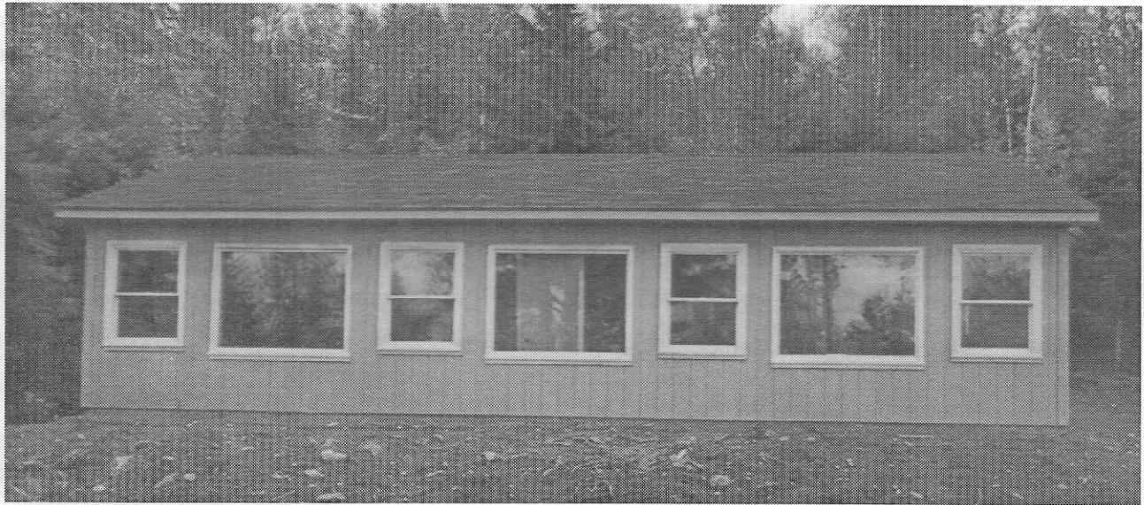
The clubhouse as seen from the northeast; those windows provide a different view of Alexander.