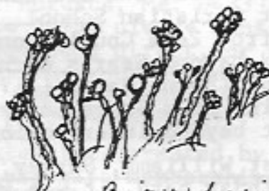
British Soldier or 'Mallet Lichen'

See if you can find these pioneer plants in your School of the Woods Nature books & paint them!