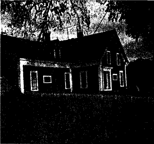
The Stevenson-Dwelle- Hatfield House - Site 25